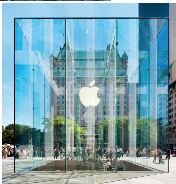
2011 design: 15 panels