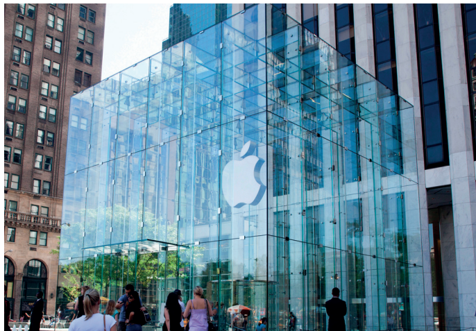
2006 design: 106 panels